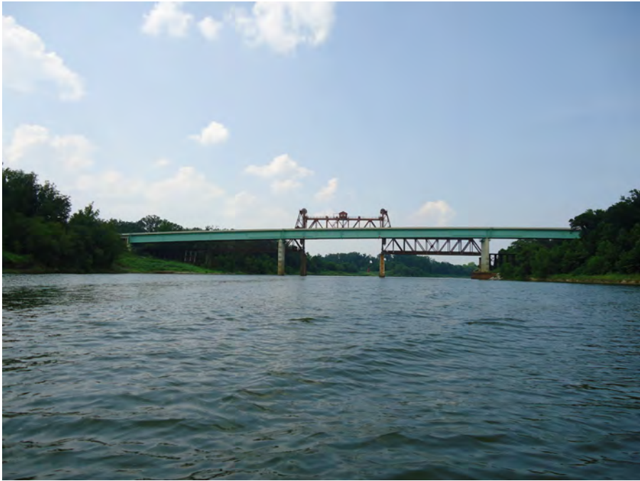
Downstream Looking Upstream